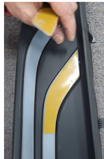
T708GX Die-cut for insert